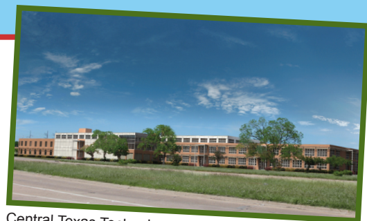
Central Texas Technology and Research Park

2006 $26.78 2007 $27.55 2008 $28.08 2009 $27.45